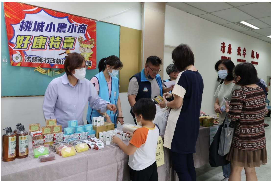
The Chiayi Branch held the “Grand Sales of Local Farmers and Merchants”