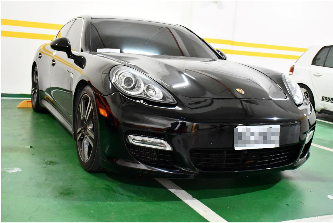
The Shilin Branch auctioned the black Porsche PANAMERA TURBO RV